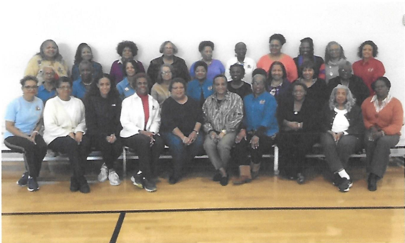
BTQG GROUP PICTURE—JANUARY 2019